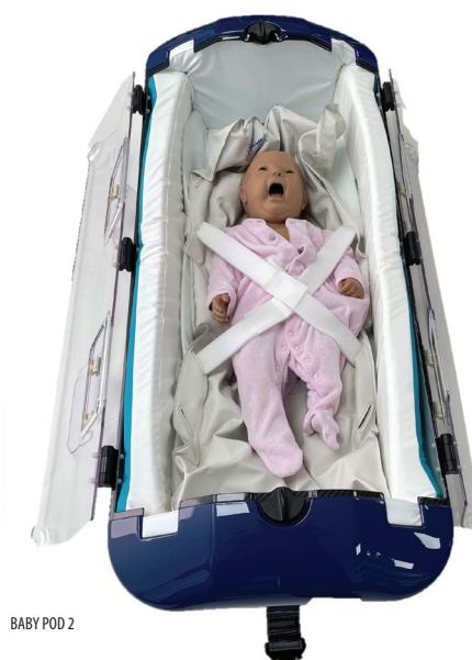
BABY POD 2