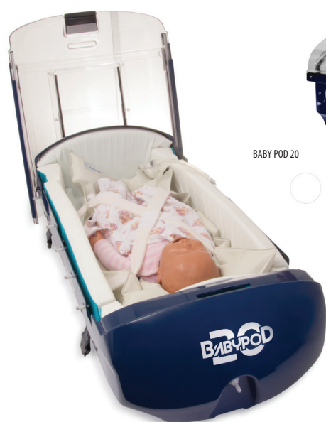
BABY POD 20