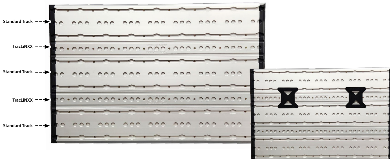
Templates help ensure proper horizontal alignment of tracks during installation

The new TracLiNXX Track acts as a spacer, filling the gap between two regular width iNTRAXX tracks and linking the upper and lower tracks together. TracLiNXX is compatible with all iNTRAXX tracks but usability is best when paired with the Standard Track.