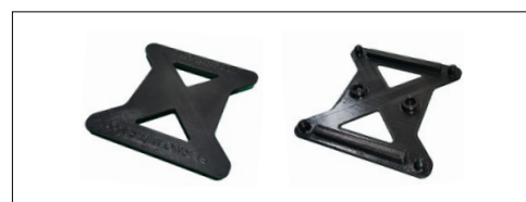
Template Kit (0480293) comprises two templates